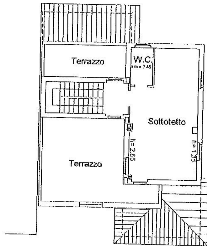
PIANO 2° (Sottotetto)